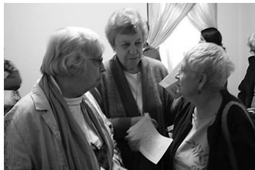
photos from The Feast of St. Lydia in January and our house blessing in May