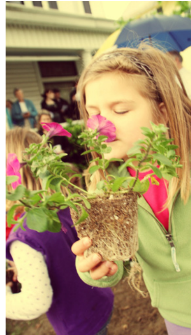
Lydia's House supporters plant flowers at 2024 Mills Avenue